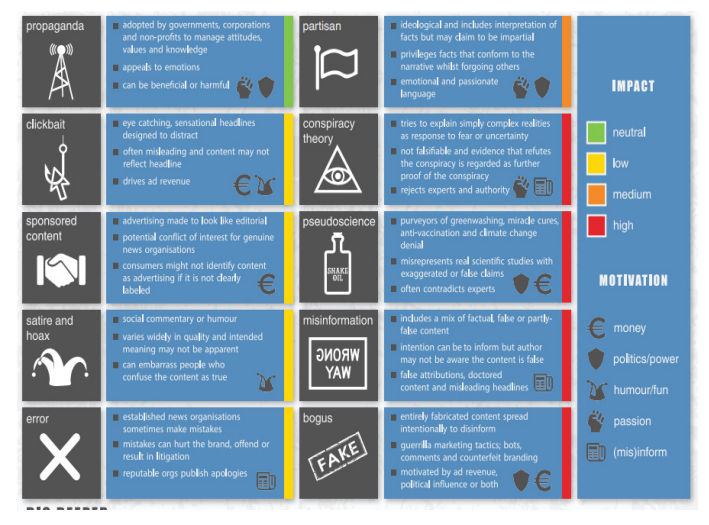
Figure 2. Categories of Disinformation and Misinformation

6) Partisan 7) Conspiracy Theory 8) Pseudoscience 9) Misinformation and 10) Bogus. eavi also describes the motivation behind those misleading news either due to money, politics or power, humour, passion and (mis)inform. Further, the organisation also categorised the level of impact, from neutral to high, for those ten categories. Four categories fall under "high impact", they are conspiracy theory, pseudoscience, misinformation and bogus. The details of the categorisation are described in Figure 2.