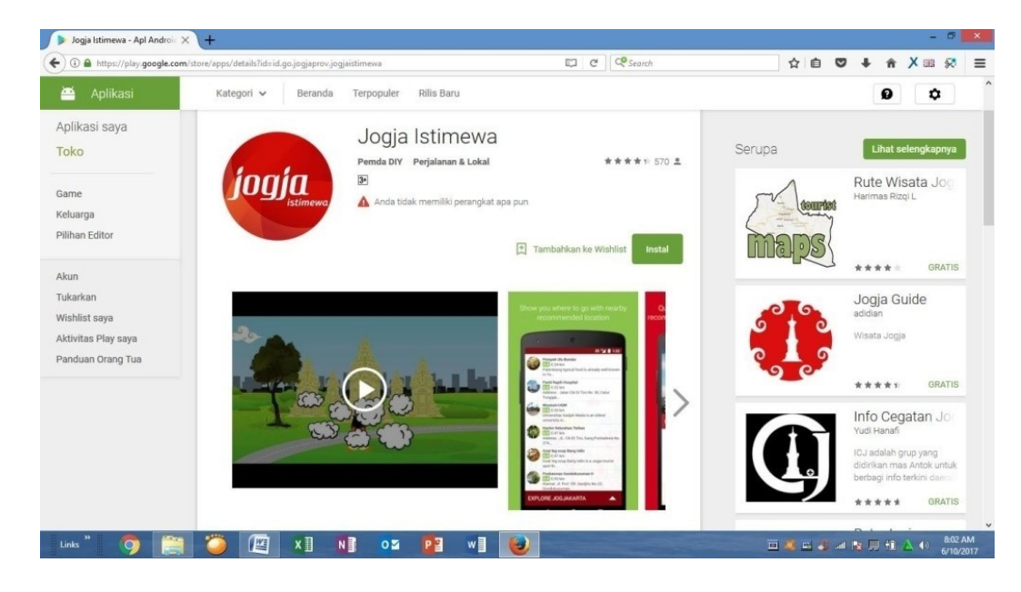
Figure 2. Jogia Istimewa application on mobile phone