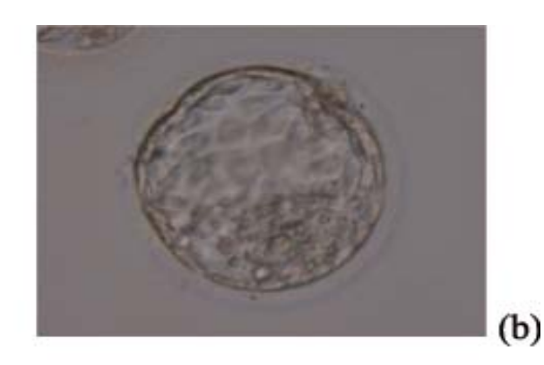
Figure 2. Morphology of blastocyst in the vitrification solution (a) and warming solution (b) (Ita Fauzia, 2014, Inverted Microscope, 320X, Zeiss)

Figure 2 illustrates the morphology of blastocyst in the vitrification solution. Notes the shrunken blastocyst in the vitrification solution (a) and reexpanding blastocyst (b) upon warming.