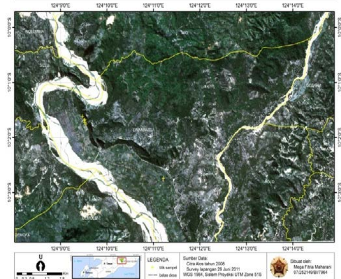
Fig 2. Alos imagery of Linamnutu village in Timor Tengah Selatan, NTT.