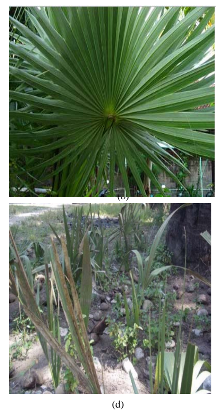
Fig 1. (a) Lontar tree, (b) Lontar leaves, (c) Lontar fruit, (d) Lontar seedling.