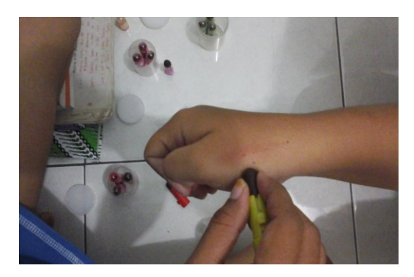
Figure 2. Smear test