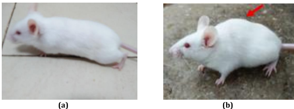
Figure 1. Normal mice. (a) and mice with osteoporosis; (b) The change of vertebrae posture becomes kyphotic is shown by arrows.