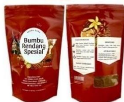
Figure 2. Selected Packaging Concepts with Size 23x14 cm

Packaging concept 2 uses aluminum packaging material combined with white plastic on the back of the packaging, which has a transparent rectangular shape as the chosen concept. The size of the pouch is 23x14 cm. Based on a previous study by Zuniarto et al. (2021), aluminum foil is a stable package consumers prefer in instant powder packages. Packaging concept 2 is in the form of a stand-up bag, with a notch/opening point in the upper right and left corners of the package to facilitate consumer opening of the package and a zipper at the top of the package, which makes it easier to reseal an open package. The font used in Packaging Concept 2 is Sansita Regular and PT serif, and the pack has images, namely Rumah Gadang and cows, as well as several spicy images. The addition of the label to packaging concept 2 complies with BPOM Regulation No. HK. 03.1.5.12.11.09955 of 2011 on the registration of processed foods, which states that the labeling of processed foods must have at least the name of the processed food, net weight, name and address of the manufacturer, list of ingredients used, registration of foods number, expired information, and production code. Given the problems identified in the introduction, the selected packaging concept can address issues of easily damaged packaging, thereby improving packaging quality. The chosen packaging concept also meets packaging labeling requirements.