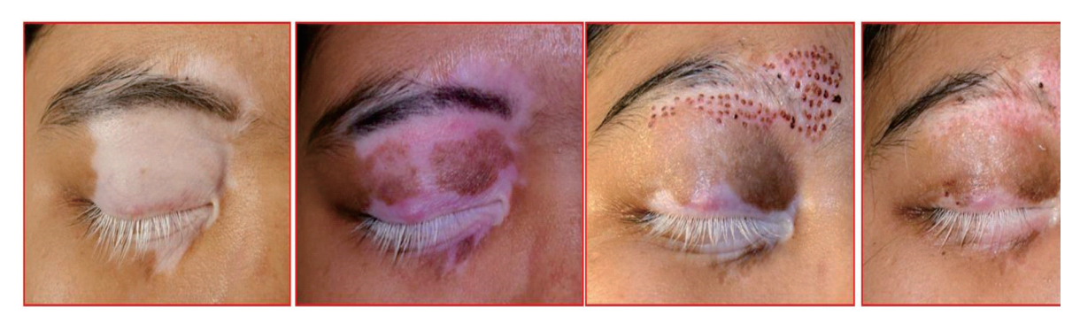
FIGURE 4. Mini punches graft from vellus hairs area onto eyebrow area as additional procedure after suction blister grafting of a Sardjito Hospital's patient (From left to right side: before procedure, a week after suction blister grafting, vellus hair mini punch grafts, a week later)

Except for hairy areas, another limitation of FUE transplantation is convenient only in small areas of skin. For larger areas, FUE transplantation must be modified to become hair follicle cell suspensions so that it can be sprayed onto large dermabraded vitiliginous skin, similar to mixed epidermal cell suspensions grafting method. The