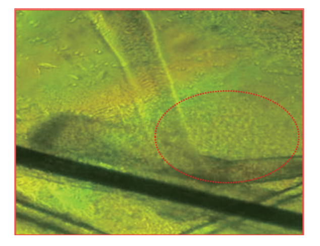
FIGURE 5. Enzymatic digestion of bulge area (redcircle) of extracted hair follicle units.

advantages of this technique are the amount of MSCs and melanocytes precursor collected in this suspension. Preparation of extracted hair follicle outer root sheath cell suspension can refer to the method of Kumar et al. <sup>68</sup> By simple warm trypsin digestion of extracted hair follicle units, a large number of mixed cells can be obtained (FIGURE 5).