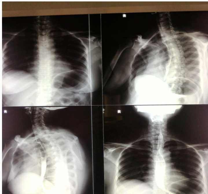
FIGURE 1. Esophagography

anteroposterior and lateral position showed no abnormalities. The results of oesophagographic examination showed a partial narrowing of 1/3 proximal of the oesophagus, which concluded of suspected esophagitis. The main diagnosis was pharyngeal phase of dysphagia with the suspected neuromuscular abnormalities.