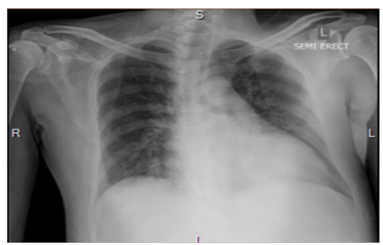
FIGURE 3. Chest X-Ray at the sixth day of treatment

cell/µL). An evaluation chest x-ray was performed. His lung showed a worse condition i.e. right bronchopneumonia with cardiomegaly. He got a nebulizer with a combination of ipratropium bromide/salbutamol and fluticasone propionate per 6 hours, furosemide 20 mg IV, methylprednisolone 62,5 mg IV, omeprazole 40 mg IV s.i.d, and hydroxychloroquin 200 mg t.i.d.