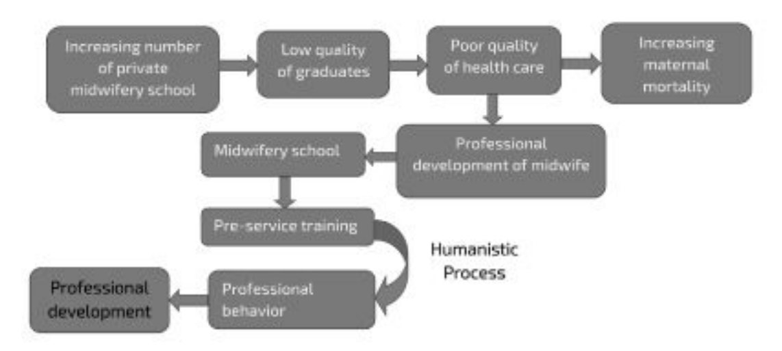
Figure 2. The framework of reserach

supervision to health profession education production. Such studies should open the eyes of policy makers so that they can take actions to prevent from deterioration of health system.