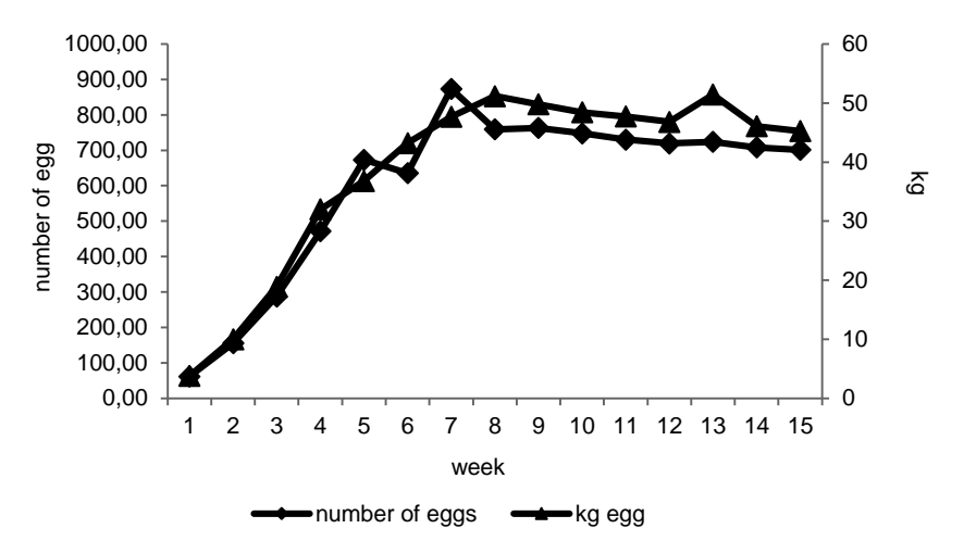
Figure 1. Graph of average egg production (kg) and number of eggs.

The decrease in the egg production took place in old birds and it was followed by the increase in the size of the eggs. It was because of the decrease in follicle recruitment rate that would