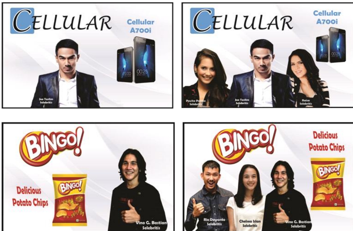
This figure shows the four scenario from this study: 1. Single endorser & low product involvement; (2) multiple endorsers & low product involvement; (3) single endorser & high product involvement; (4) multiple endorsers and high product involvement.