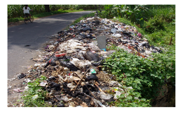
Figure 2. The situation of waste dumped along the street in 2000 in Sukunan Village

The nuisances regarding environmental problems also take place in Yogyakarta. Although they live in a big modern city, a well-known touristic destination, Yogyakarta's inhabitants are still unaware of environmental issues such as waste management. The absence of social resources and services to share environmental knowledge (how to interact with nature sustainably) is at the root of the problem. Within this context, the active participation of the local community is essential to increase the level of self-consciousness about how to preserve nature and manage waste. Being part of Yogyakarta's urban area, the village of Sukunan also faced the same problems until 2004, when a vital transformation process took place. Before that moment, the village was full of dumped or