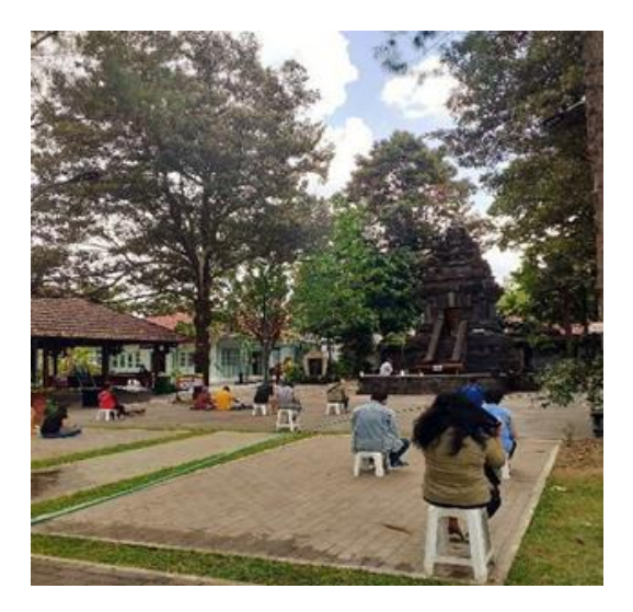
Figure 3. Ganjuran Temple Building As a Place to Pray for Tourists

The role of the temple in shaping the experience of religious pilgrimage tourism also occurs in Dian, a tourist who is neither Catholic nor Javanese. Dian feels there is a connection between her Hindu identity and the Hindu elements found in the temple. As a Hindu, she is used to praying in front of a temple that visually resembles a temple in shape and appearance and the characteristics of an outdoor prayer room. Not only the temple but also the temple yard, which also functions as a prayer room in this church complex has much in common with Hindu prayer halls. That concept of the temple and temple courtyard as "prayer room" in the open nature reminds her of one of the values of Hinduism, namely the value of being one with nature.