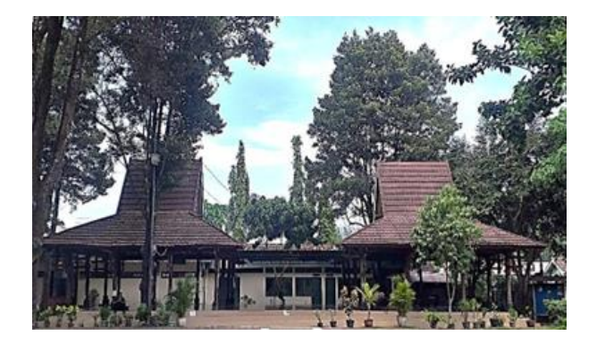
Figure 8. Two Schmutzer Pavilion Buildings

The hall usually functions as a gathering place for many people or srawung in Javanese terms. In the context of the Ganjuran Church pilgrimage tour, the Schmutzer Hall has various functions, it can be used by tourists to sit, relax, and sometimes it is also used for meetings of the Church's