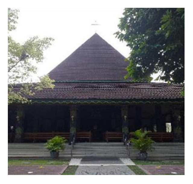
Figure 4. Ganjuran Church Building in the Form of A Joglo

This church, similar to Keraton (a type of royal palace in Java, Indonesia) was founded in 2009 and the first stone was laid by the Archbishop of Semarang at that time. For Schmutzer, founding a church allowed the Catholic religion, which at first seemed distinct from the surrounding 'identity' more dominant in other religions, could merge and become 'a new identity' within the community, especially in the Ganjuran area. The adoption of Javanese architectural styles such as Joglo houses with an interior design full of Javanese nuances and knick-knacks resembling the Keraton gives a strong impression that the Ganjuran Catholic church can exist and create a different identity that makes the community around it more dynamic.