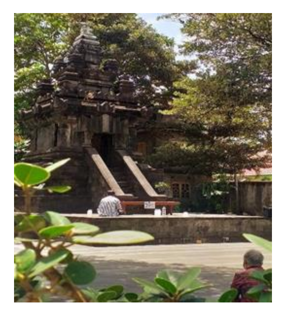
Figure 2. Ganjuran Temple Yard As a Prayer Room for Tourists

This temple was built as a monument to express the Schmutzer family's gratitude to God that the Gondanglipuro Sugar Factory survived the blows of the world economic recession (the malaise era)<sup>8</sup>. Before this temple was built, Schmutzer studied and understood Javanese culture in depth, so the temple built both in its architecture, reliefs and south-facing position was very synonymous with Javanese philosophy and culture. The date of the temple's blessing (February 11) coincides with the day of Our Lady's Apparition in Lourdes, the relationship between this date is one of the factors that builds the sacredness of the temple. The inauguration of the temple has also put it on par with famous pilgrimage sites in Indonesia such as the Mary Cave in Sendangsono. This temple is expected and intended as a widespread Catholic devotion.