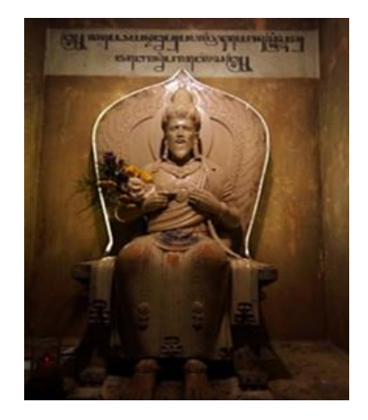
Figure 7. Statue of Jesus in the Ganjuran Temple.

Simultaneously with the ceremony of laying the first stone of the temple, the priest blessed the statue of Jesus Christ in the form of the "King of Java" and highlighted the symbol of the Sacred Heart of the Lord Jesus on the chest of the statue. The statue of Jesus in the church is usually placed standing, but the statue of Jesus in the temple is seated on a throne over the padma, showing the degree and power of Jesus as a king<sup>9</sup>. This is supported by Javanese title on the statue, which reads " Sang Maha Prabu Yesus Kristus Pangeraning para Bangsa " (You are Jesus Christ the King of All Nations). The attire worn on the statue of Jesus is also typical attire of Javanese kings with a crown on their heads<sup>10</sup>.