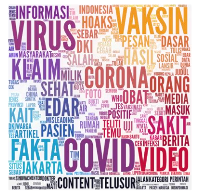
Figure 2 Wordcloud related Covid-19 Hoax

Preprocessing text eliminate words to reduce noise from dataset. The results of the word weighting TF-IDF can be seen in wordcloud in Figure 2 and scatter word shown in Figure 3.