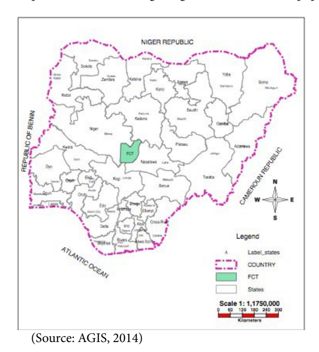
Figure 1. Nigeria Showing FCT.

The Abuja Master Plan, the FCC was conceived to accommodate estimated population of 157,750 persons in residence on inauguration in 1986, then 485,660 persons in 1990, 1,005,800 persons in 1995 and 1,642,100 persons in 2000 [FCDA, 1979]. It would then grow to a maximum population of approximately 3.1