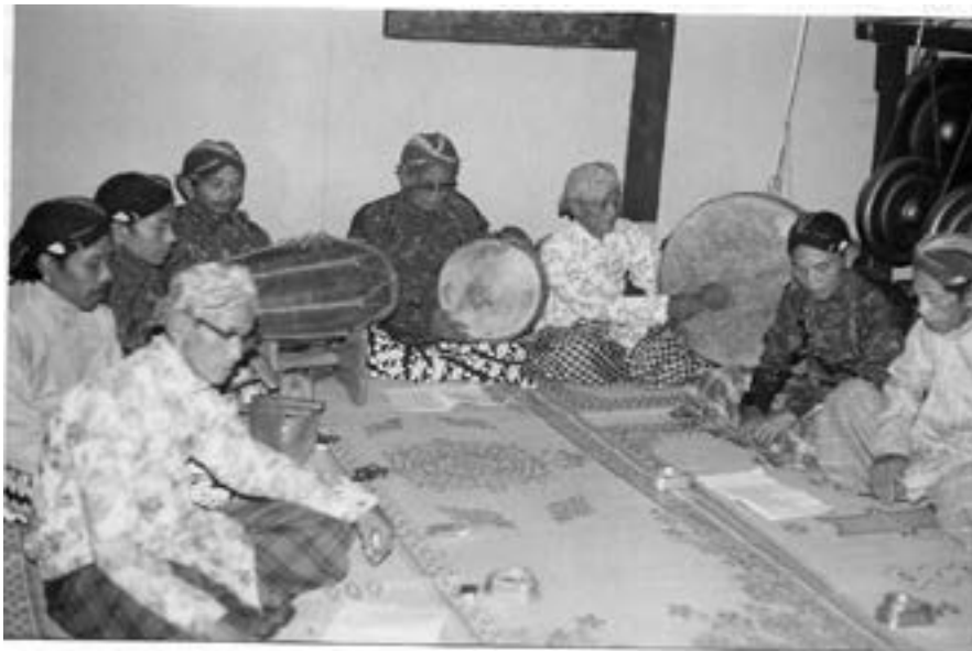
Figure 3. The Group of Larasmadya Art from Temulawak, Triharjo, Sleman.