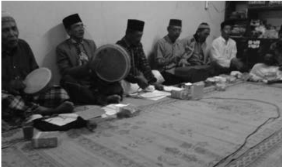
Figure 2. The Group of Larasmadya Art from Durenan, Triharjo, Sleman.