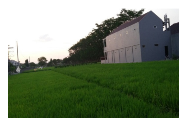
Figure 6. Some of the Remaining Rice Fields in Tamanan Village