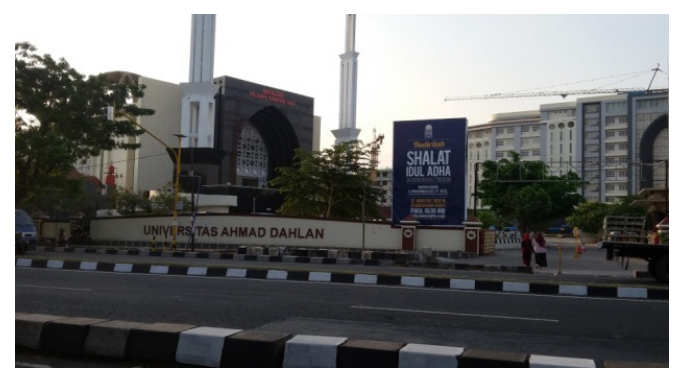
Figure 3. The Ongoing Construction of the Ahmad Dahlan University Campus in Tamanan Village