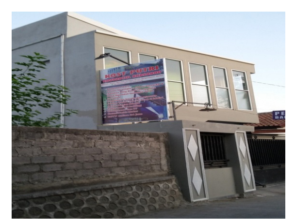
Figure 4. Student Lodgings Appearing Rapidly in Tamanan Village