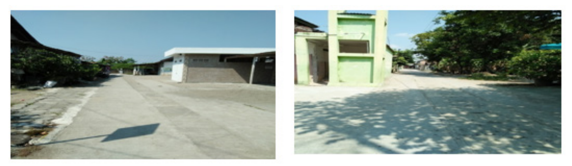
Figure 2. The Roads in Tamanan Village

neighbours would jointly repair a damaged house; nowadays, however, the residents have abandoned such reciprocity and prefer to pay construction workers (e.g. masons and carpenters). This type of change may have occurred due to the effects of urban sprawl, whereby urban social values have extended into the study area.