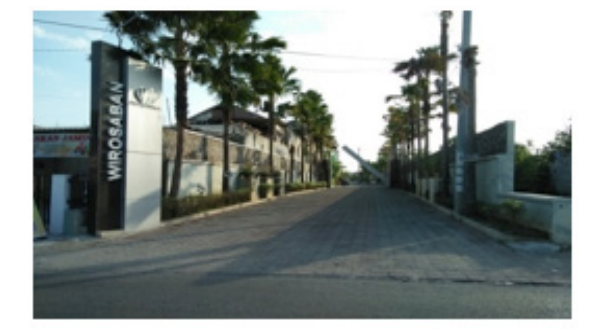
Figure 5. Housing Complex Built by Developers in Tamanan Village