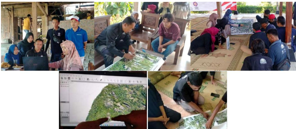
Figure 3. 2D and 3D Participatory Mapping in Small Groups for Area Identification by Using a Map and 3D Model in the Nglanggeran A.V Area