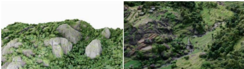
Figure 2. Results of 3D Data Processing from Patched Aerial Photographs

This 3D participatory mapping is considered very effective. Analysis from local managers for the identification of the Nglanggeran A.V area can be explained in detail. Other