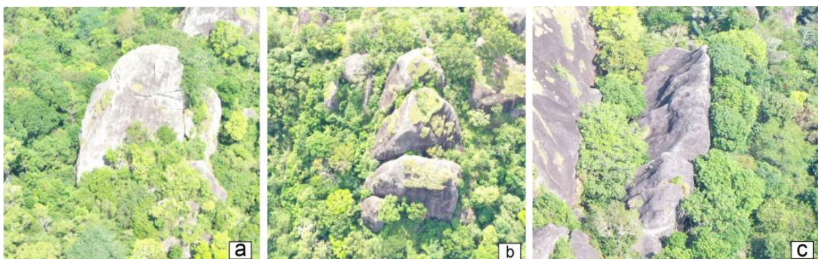
Figure 5. Mount Buchu (a); Mount Lima Jari (b); and Mount Kelir (c)