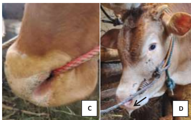
Figure 2. Clinical symptoms of cattle suspected of FMD, (C) lesions on the nasal mucosa of cattle, (D) foamy hypersalivation.

concentrations before, during, and after administration of therapy in cattle suspected of FMD ( p < 0.05 ).