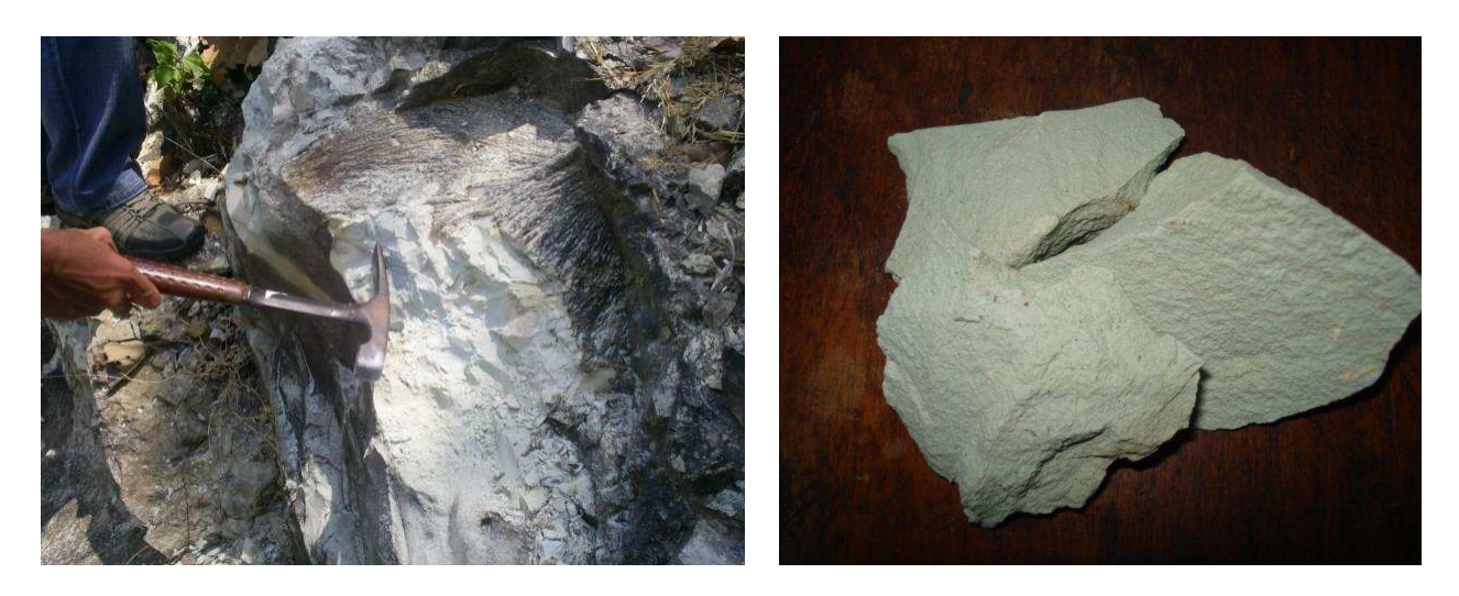
Figure 1: The surficial zeolitic and bentonitic tuff at the Sidomulyo area (Gunungkidul regency) and the Bandung area (Boyolali regency), respectively, Java Island

al. and this is maybe because of different locations of samplings. The Bandung bentonitic tuff from the XRD result displays the content of montmorillonite, clinoptilolite-heulandite, quartz, illite, kaolinite, chlorite, plagioclase (albite & anorthite), and orthoclase. This also agrees with the findings of Titisari et al. (2006).