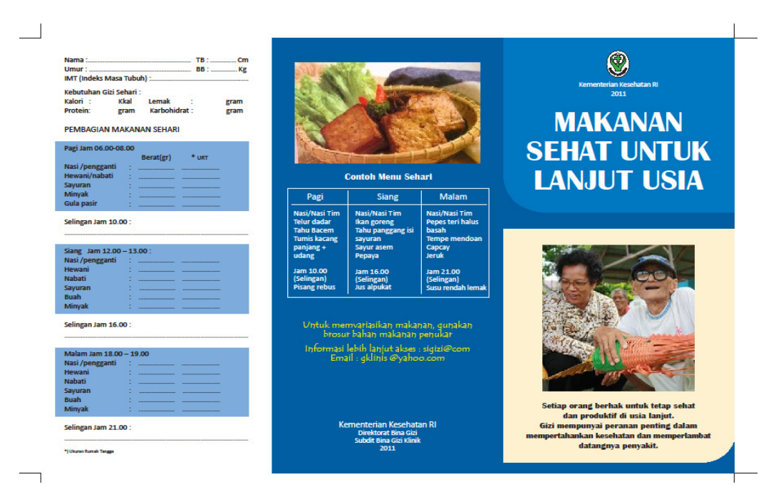
Figure 2. Health and nutrition of the elderly pocketbook