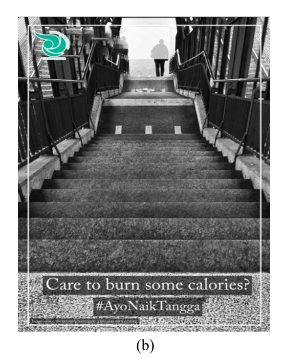
Figure 2. Posters as the health promotion media: (a) Healthy diet message; and (b) Physical activity message