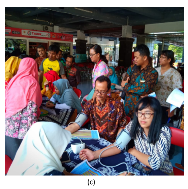
Figure 3. Training for HPU Cadres & Launching Posbindu PHSS; (a) roleplay on the waist measurement; (b) role play for the cholesterol and blood glucose check; and (c) Posbindu PHSS

members and lecturers. In addition, the responses of the university staff and students were beyond the expectation. The seminar committee had to refuse several seminar participants due to the auditorium capacity. Many questions and suggestions came from the seminar participants for the HPU program. This response reflected that the half-day seminar could succeed to raise people's awareness of the NCD problems among university staff members and students. Moreover, many local newspapers published the news of the seminar.