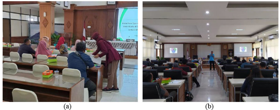
Figure 1. Integrated Training Program. (a) Pre-Test. (b) Delivery of topic from an expert.

Knowledge was assessed before and after the training using questionnaires that consisted of multiple-choice questions