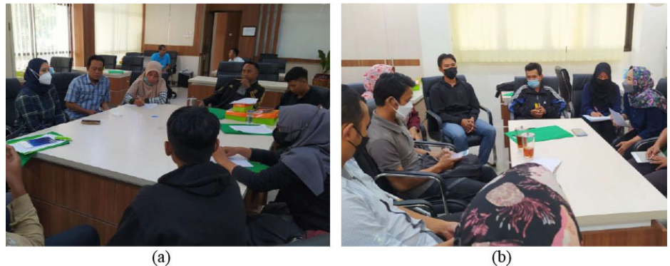
Figure 2. Focus Group Discussion (FGD). (a) FGD Group A. (b) FGD Group B.