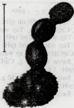
Figure 1. Smooth Spores of Strain 337; Transmission Electron Micro- graph ( \times 21,000 ), Bar : 1 \mu\text{m} .

Strain 337 produced a well-developed branching of vegetative mycelium, but less heavy branching of aerial mycelium on agar medium. Mature spore chains produced a short spiral with up to 3 turns. Sclerotic granules, synnemata, and sporangia were not observed. The spore surface was smooth and had ellipsoidal in shape (Fig. 1).