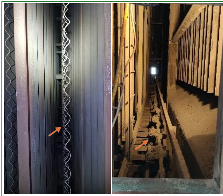
Figure 1. Internal ESP ( Discharge Electrodes and Hammer Rapping )

The process begins when exhaust gases containing fine particles enter the ESP chamber. Inside the ESP, the discharge electrodes, typically in the form of spirals or wires, impart an electrical charge to the dust particles. This ionization process creates a strong electric field that attracts the charged particles toward the oppositely charged collecting plates. The collecting plates, arranged parallel to the discharge electrodes, act as surfaces where the dust particles adhere.