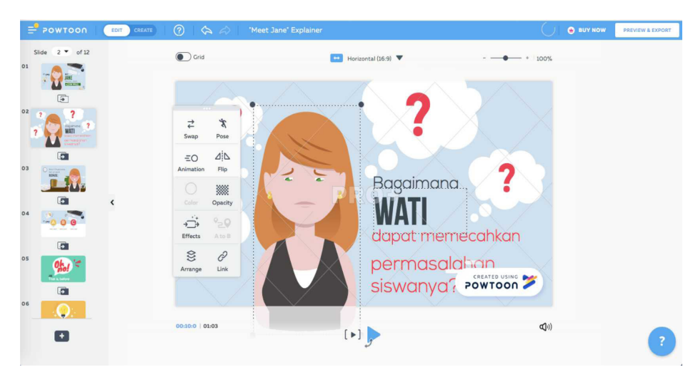
Figure 1. Creating a scene and text in Powtoon®

Powtoon® enables the users to create their own animation videos by providing animation attributes, i.e. icons, characters, text, background pictures, etc., and the technology needed to animate those components. It also provides various effects and video editing tools to round up the whole video production process. Users can choose the icons and place it on the selected background to create a scene and easily add the animation effect by clicking on the buttons (see Figure 1 and 2).