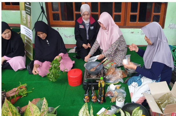
Figure 4 . Processing of aquaponic harvests

The next mentoring activity involved a joint harvest and the processing of aquaponic harvest products (Figure 4). During this activity, catfish were harvested from Aquaponic Systems 1 and 2. From a total of 1,000 fingerlings released at the start of the practical training, on December 7, 2025, a harvest of 65 kg was obtained from Aquaponic System 1, and 50 kg was obtained from Aquaponic System 2 (Table 4). During maintenance and monitoring, several dead catfish were also found. This condition is part of the dynamics of aquaculture, which are influenced by environmental conditions, water quality, and fish density within the systems. In addition to the catfish harvest, this activity included a simultaneous vegetable harvest from each aquaponic system. On average, each system yielded approximately 1 kg of vegetables at harvest (Table 4). This amount was smaller than the catfish harvest because the number of racks or growing media used in the aquaponic system was still limited.