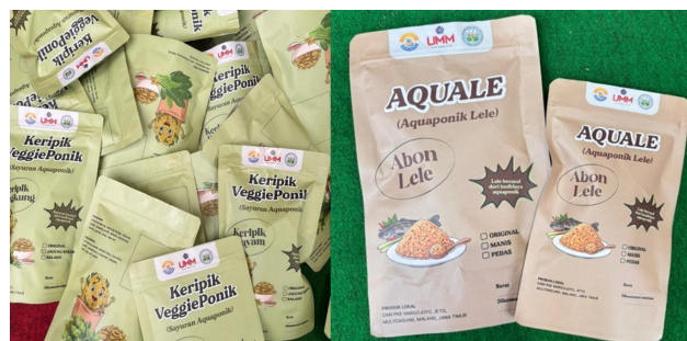
Figure 5 . Processed fish and vegetable products from the aquaponic harvest

The second group processed catfish into abon. This activity was carried out under the guidance of FWE members and followed the steps for making catfish abon: cleaning the fish, steaming, shredding the meat, mixing the spices, and frying the abon. All stages were carried out through hands-on practice so that FWE members could fully understand the processing procedure, from raw materials to finished catfish floss. A total of 5 kg of catfish was used in the catfish floss-making practice. This quantity was chosen to save time during the activity, particularly during the processing stage. The spices used were prepared in advance by the community service team to ensure that the practical session ran more efficiently.