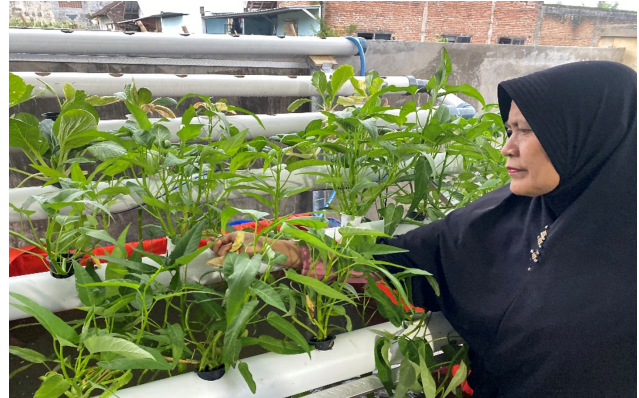
Figure 3 . Aquaponic farming practices

Zahrani et al., 2024; Wang et al., 2023). According to Al-Zahrani et al. (2024), a decline in water quality in an aquaponic system affects plant performance, quality, and yield, as well as fish physiology, growth rates, and feed efficiency. This system requires synchronized growth between fish and plants, especially during the first week, which is a critical adaptation phase in the aquaponic cultivation process (Baganz et al., 2022; Zamnuri et al., 2024).