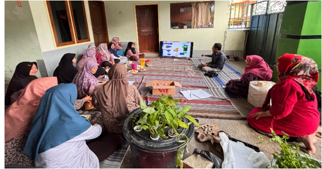
Figure 2 . Presentation on aquaponics

in this community service activity were pak choi, water spinach, spinach, and celery. The plant propagation process began with sowing vegetable seeds and preparing seedlings for planting. The sowing process used charred rice husks as the growing medium for the vegetable seedlings. FWE members took turns receiving intensive guidance to carry out the sowing process. The seedlings resulting from this process were later transferred to the aquaponics system after the assembly was complete.