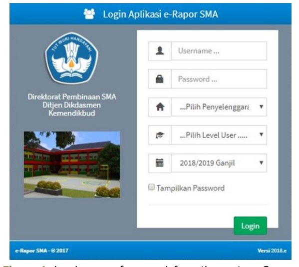
Figure 1. Log in page of e-rapor information system.

The opening activity was carried out by M. Dwiyan Aditya, M.Pd. This activity was carried out to discuss the agenda which included the training activities and technical guidance on the use of e-Rapor information systems (Figure 1). This training was carried out through several stages i.e., namely training on the use of e-Rapor information systems from which the users became the operator. This training for classroom teachers, counseling teachers, and students were expected to bring information and guidance to access the e-Rapor information system