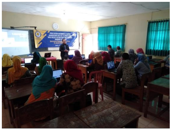
Figure 2. When Exposing the e-Rapor-based Information System Material

The process of providing material to teachers at the SMA/SMK Persada Lampung is carried out in class. All the teachers were enthusiastic about participating in the training activities. Even though schools do not have adequate facilities for conducting e-Rapor information system training, teachers are willing to bring their equipment. As shown in Figure 2, teachers actively participate in e-Rapor information system training activities. They use devices that they carry themselves, namely laptops. Their enthusiasm was also shown with a high curiosity through the questions raised.