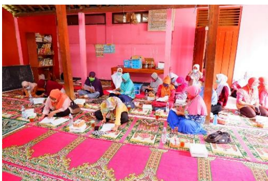
Figure 3. The mothers from the surrounding area of Ash Shiddiqiyah Orphanage were filling post-test questionnaires while being guided by facilitators.