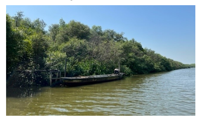
Figure 1. Kebun Raya Mangrove Medokan Ayu

Pokdarwis Medokan Ayu has been reorganized, so that the Medokan Ayu Mangrove Botanical Gardens has interesting photo spots. The natural nuance of the mangrove forest is maintained so that the combination of the blue sky and green plants becomes an attractive panorama for some tourists. The Medokan Ayu Mangrove Ecotourism is also equipped with water bike tours, a playground for children, and some gazebos equipped with flower gardens and boats to surround the mangrove forest.