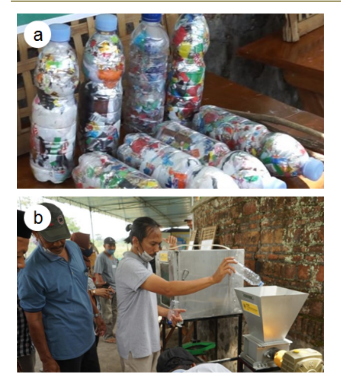
Figure 3 . Inorganic waste training: (a) Ecobricks; (b) Plastic pot moulding machine

reduce the size of plastic debris with complex characteristics, such as PET, bottle caps, shampoo bottles, and others. The plastic liquid is then printed in a plastic molding machine using the principle of heating plastic seeds from the previous process with the assistance of a heating oven. Then, additional varieties of plastic, including snack packaging and crackle plastic, are transformed into eco-bricks. The eco-bricks method is regarded as a solution to the plastic waste problem (Zuhri et al., 2020).