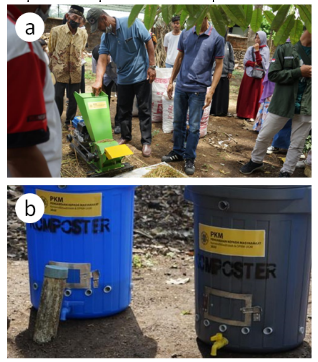
Figure 2 . Organic fertilizer training: (a) trial of organic matter shredding tools; (b) aerobic composters

Inorganic refuse, such as plastic waste, will be recycled into products like plastic containers. A plastic shredder will