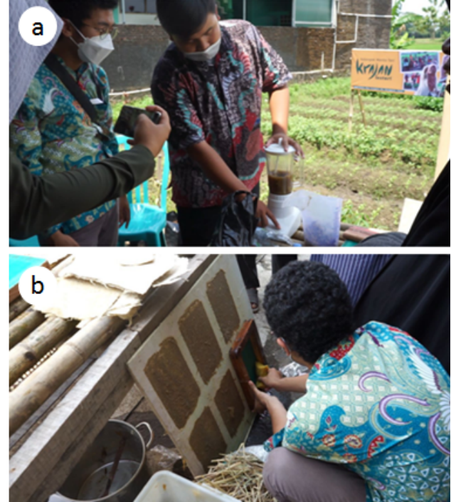
Figure 4 . Rice straw paper making training: (a) Pulp making process; (b) Paper making process

The intended participants for this training on inorganic debris collection are Karang taruna. During this pandemic, it is anticipated that this activity will provide additional knowledge and experience as well as occupy the village