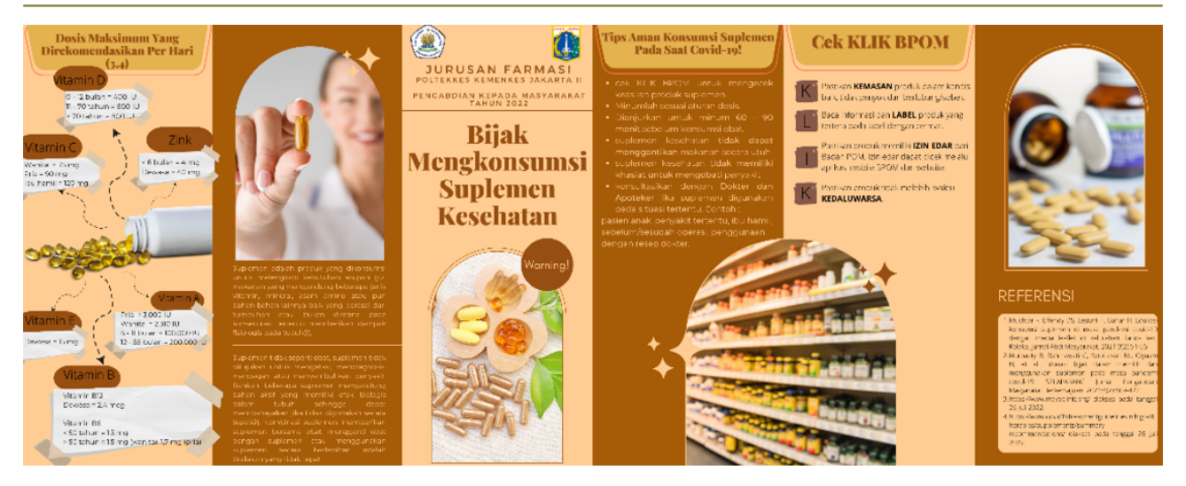
Figure 4. Educational leaflet related to vitamins and health supplement

of the activity can be additional information for participants. Leaflet media is also easy to make, inexpensive, and can be distributed to the public (Muchtar et al., 2021). Educational counselling and leaflets containing material related to vitamins and health supplements, ranging from definitions, benefits, wrong myths related to the use of health supplements, daily dosage limits, how to use them correctly, the principle of selection and identification of product authenticity through a "CLICK" check according to BPOM regulations and visual inspection of the packaging.