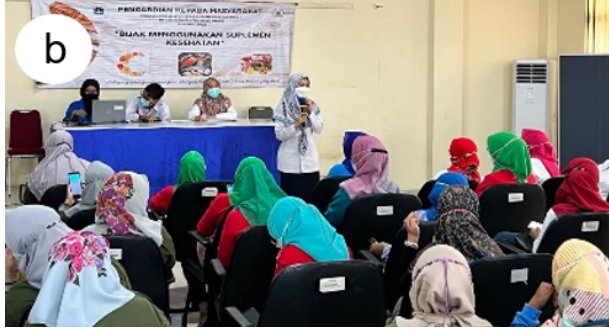
Figure 1 . (a) Implementation of community service activity; (b) Question and answer session

Before the activity started, participants were asked to fill out a post-test questionnaire to measure participants' prior knowledge regarding the use and identification of the authenticity of vitamins and health supplements. Afterwards, participants were given direct education and leaflets regarding vitamins and health supplements. At the end of the material, the participants returned to work on the post-test with the same 15 statements as the pre-test. The pre-and post-test results can be seen in the Figure 2.