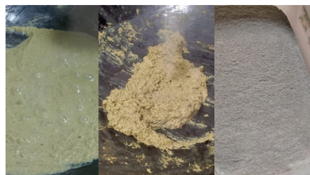
Figure 1 . DURASI product making process

In an effort to make the outcomes of the counseling and training sustainable, the community service team created a WhatsApp group for target community to facilitate continuous assistance and consultations. The assistance has been provided since the counseling and training ended, and this was a means of guidance and evaluation of both programs (Lusiyana, 2020). With this group, discussions can be held when the community encountered problems in the process of making DURASI independently. The team also tried to motivate the community to stock DURASI as a substitute for salt in their respective homes, especially those with a family history of hypertension.