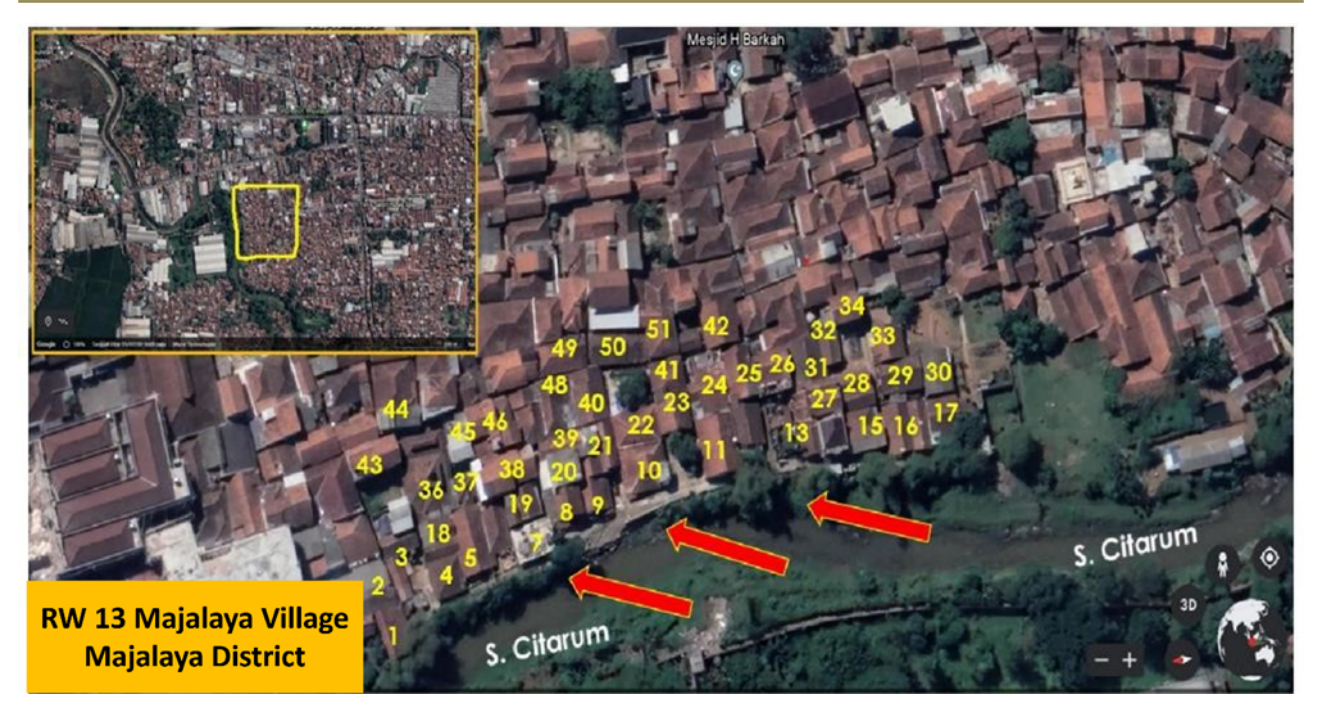
Figure 1 . Overview of river cliff locations

which cannot withstand scouring currents. These scours get deeper and deeper, reducing the stability of the cliff. If not addressed immediately, it will cause more severe damage. Damage to riverbanks will damage river buildings and endanger people's safety (Guo et al., 2009).