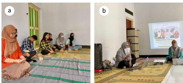
Figure 1 . Reproduction health education: (a) Mancasan Kleben adolescents receive counseling materials; (b) The resource person delivers the materials

According to Idrizi et al. (2021), the learning process can be successful when participants develop valuable practical skills, such as problem-solving, quick information analysis, and conclusion forming. In this counseling, participants also learn about how to work and play an active role in learning groups, thus developing the youth's ability to prepare them for a collaborative work environment (Figure 1).