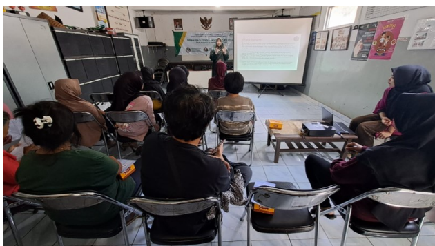
Figure 2. The activity of the training program

This activity was carried out in June 2023 and took place in the morning, from 9.00 to 12.00 WIB, so participants still had the spirit in the morning to receive the material. The activity was organized in the RW.03 community hall Figure 2. The following are the results of the pretest and posttest administered to assess the participants' understanding of the training participants.