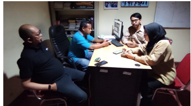
Figure 1 . Problem identification process in Braga Tourism Village

POKDARWIS Braga and people who own MSMEs (Micro Small and Medium Enterprises) in the area where they live namely the Braga area.