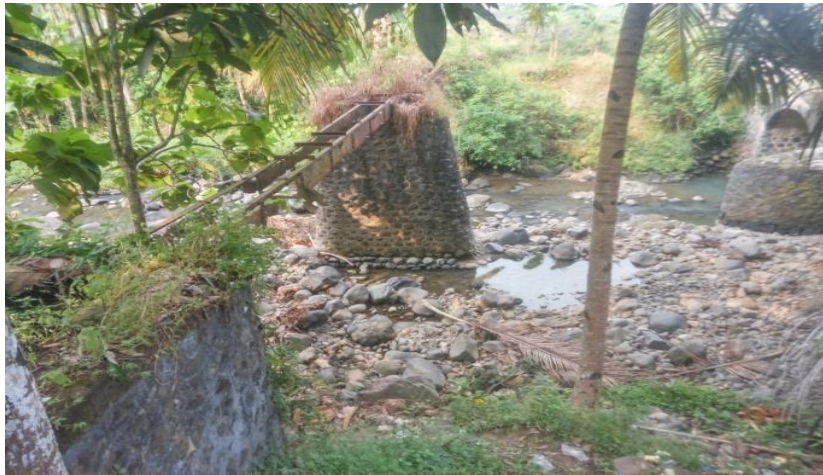
Picture 2. The location of the initial installation of the poaching prohibition sign, which was destroyed by an "unidentified person"

Cognitive social theory explained the factors that affect the collective efficacy (Bandura, 1998). The high dependence of a group in the presence of outsiders reduces the level of collective efficacy. This condition is referred to as collective powerlessness. Faced with a high reliance on external factors, the conservation group develop locality strategies.