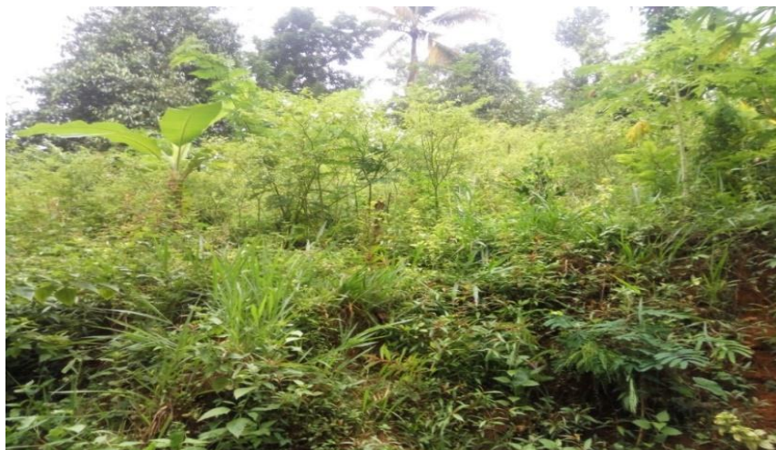
Picture 1. Farming chillies naturally using no-till farming (TOT), without synthetic pesticides/fertilizers on Menoreh Hills

The fourth theme obtained in this research was that threats to the sustainability of nature are mostly been done by man. Neglecting the diversity of surrounding life was considered as a common cause of damage to the diversity of the flora and fauna. This theme reflected the experience of feeling the negative impact of human behavior on the environment. It was revealed that once, "land became corrupted and hard", "plants dry out and die" and "the diversity of local varieties goes extinct".