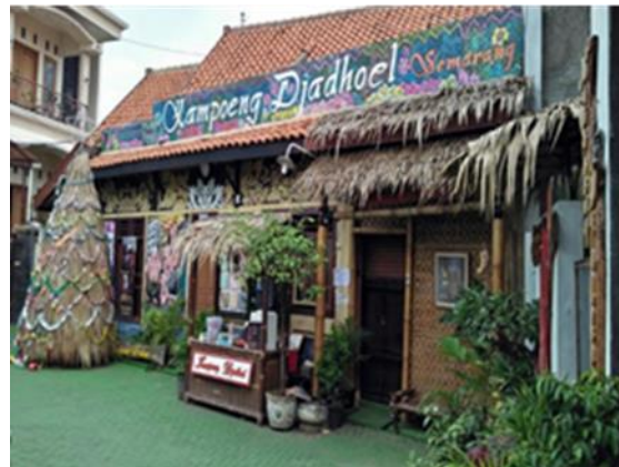
Figure 2. Kampung Batik Gedong