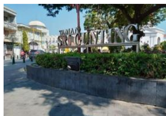
Figure 4. Kampung Batik Gedong