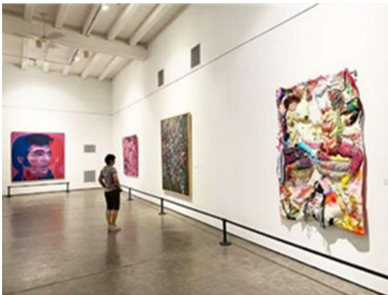
Figure 1. Semarang Contemporary Art Gallery