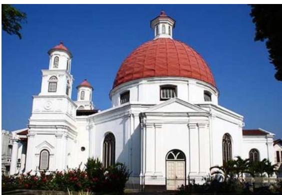
Figure 3. Gereja Blenduk