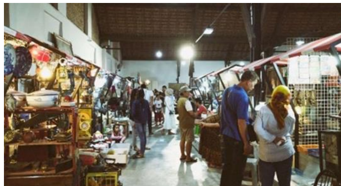
Figure 7. Pasar Klitikan