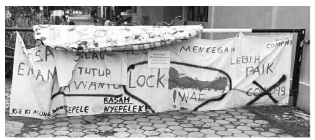
Figure 4. Banner "Koe ki mung wong sepele" displayed in Karangasem – Condong Catur

[Prevention is better. Love your life. You're nobody, never underestimate.]