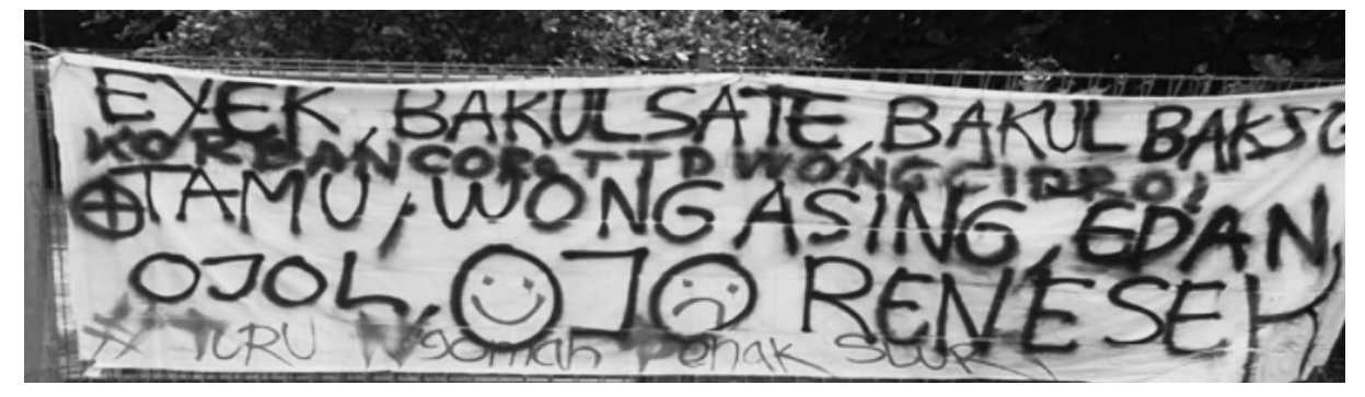
Figure 1. A banner displayed in the vicinity of Jogja Bay waterpark in Sleman - Yogyakarta

[Mobile greengrocer, satay hawker, meatball hawker, visitor, stranger, lunatic, online taxi bike are not welcome. Corona victim is a betrayal.]