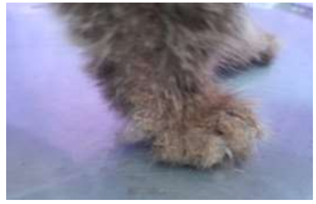
Figure 3. (A) A kitten infected with Sarcoptes scabiei with lesions on the ear pinna; and (B) on the legss