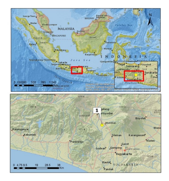
Figure 1 . Map of sampling collection site for C. gachua samples in Keji River, Magelang, Central Java

(Figure 2). Approximately 100 mg of muscle tissue from two individuals (KTS-01 and KTS-02) was preserved in 99% ethanol and each was placed into 1.5 ml tube. Fish samples were then brought to Laboratory of Genetics and Breeding, Faculty of Biology, Universitas Gadjah Mada and stored at 4°C until processed.