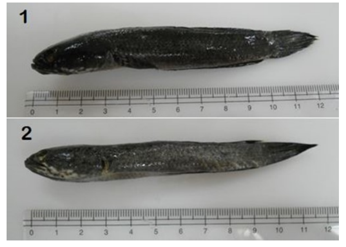
Figure 2. C. gachua collected from Keji River, Magelang, Central Java (1) KTS-01 and (2) KTS-02

Chromatograms of the two dwarf snakeheads were checked and assembled using SeqMan, and edited using EditSeq Pro Program Lasergene DNASTAR software package (DNASTAR Inc., Madison, USA). Consensus sequences of the 16S mtDNA were checked from forward and reverse. The sequence of each sample was verified using BLAST. The composition of mtDNA 16S nucleotide of each fish sequence obtained in this study were then calculated using DNA Statistics from EditSeq menu. The composition of C+G was validated using DnaSP v.5.10.01 (Librado and Rozas, 2009). The comparison nucleotide composition of dwarf snakehead fish used was taken from GenBank (accession number KU986900, KU238074, and HM117234-HM117238).