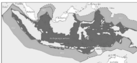
Map 2: Indonesian archipelagic waters, territorial sea and EEZ under 1982 UNCLOS

nautical miles, measured from baselines determined in accordance with this Convention.” States exercise full sovereignty and competence in their territorial sea and air zone above it (Bardin, 2002); Article 76 defines continental shelf as “seabed and subsoil of the submarine areas... [with] a distance of 200 nautical miles from the baselines from which the breadth of the territorial sea is measured”; whereas exclusive economic zone is an area which maximum measurement is “200 nautical miles from the baselines from which the breadth of the the territorial sea...”, based on Article 55, in which a state is exclusively entitled for economic (e.g. fishing) and research enjoyment (Robertson, 1983). 5 Governed by Article 19, right of innocent passage “permits a ship of a foreign nation to enter the coastal waters of another state if the navigation is peaceful and not offensive” (Agyebeng, 2006). Immunity of warships on high seas in Article 95.