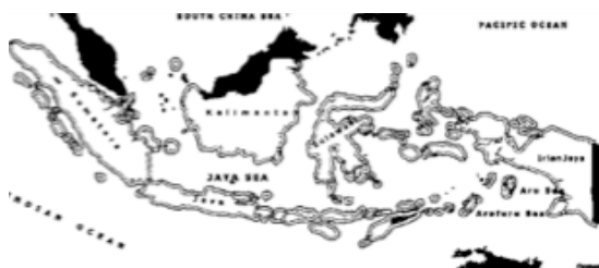
Map 1: Indonesian territorial waters under 1939 Dutch Ordinance [Source: http://www.uruqulnadhif.com/2015/06/uu-kelautan-uu-pengelolaan-wilayah.html ];

territorial sea, continental shelf and exclusive economic zone (EEZ) as examples, as well as (2) the right of flag States, with innocent passage and immunity of warships in the high seas to name a few. 5 These newly codified concepts are exercisable to all UNCLOS States Parties, including Indonesia.