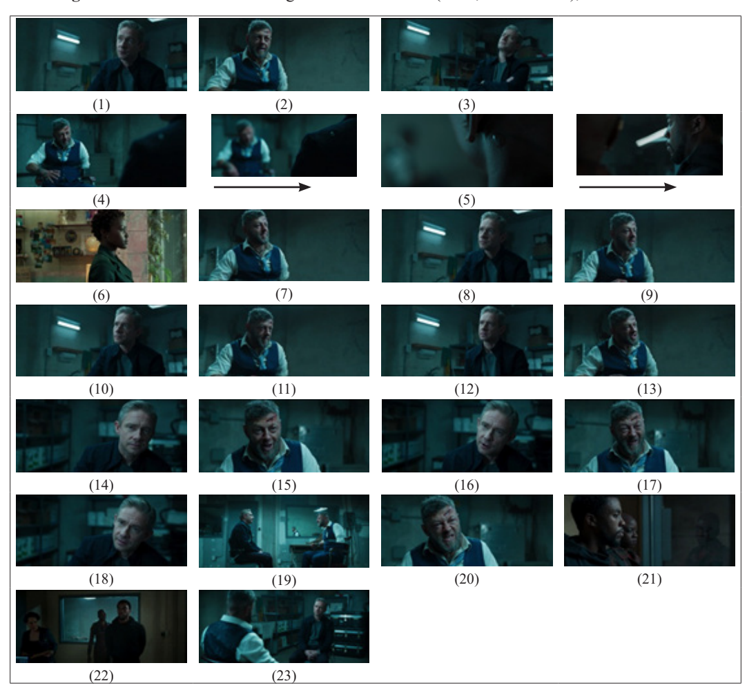
Figure 2. Shot Extract from Coogler's Black Panther (2018, 45:47-46:07), Eldorado Scene