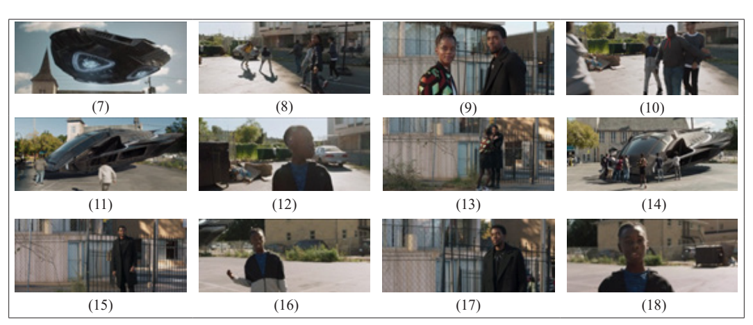
Figure 5. Shot Extract from Coogler' Black Panther (14:37-15:20) Oakland Scene

This scene depicts the globalization as part of hybrid culture as well as emphasizes the setting and its surroundings. The underprivileged African-American living in Oakland has a long history. It is the establishment of Black Panthers party in the city which happened in 1960s, defending the black's right and fighting for those who were treated unfairly. Accordingly, this scene strongly suggests the same notion of Black Panthers party's aims which are portrayed by Wakanda in this movie.