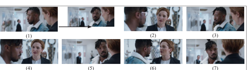
Figure 4. Shot Extract from Coogler' Black Panther (15:40-17:00), Museum Scene