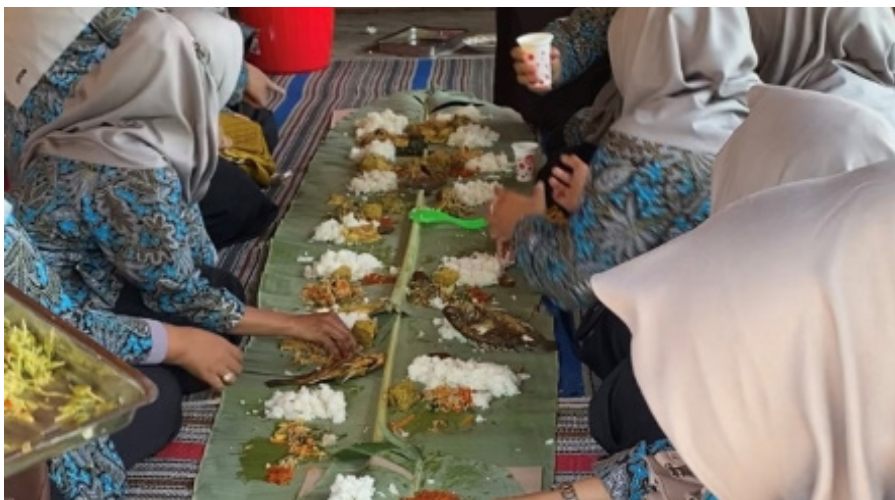
Figure 3. Bancakan with members of PKK in Desa Pesanggrahan.

As stated before, the women in Desa Pesanggrahan especially the PKK Community already achieved the third level of Maslow's hierarchy of needs, which include the feeling of belonging in the community. This was shown in how often PKK Community helps each other. Some of the examples that shows how they uphold the value of working together as a community is when some women wanted to participate in a cultural exhibition by presenting their local jamu , the leader of the PKK took part to help by getting legal permits and documents from the village's cooperation. The leader herself even took her time to pursue the village's chief to get some legal documents for permission to market their jamu widely. This proves how their sense of belonging in the community where the members of the PKK will do anything to help the progress and development their own members.