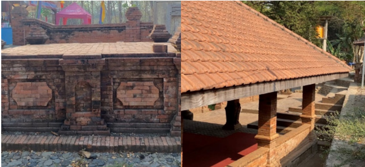
Figure 2. Traditional Sanggar and Pondokan in Desa Pesanggrahan use red brick.

Notably, women of the PKK, have demonstrated commendable awareness of their indigenous cultural heritage and the potential of it eroding with the globalization that happens now. The community itself has taken proactive steps in organizing training programs designed to empower women in Desa Pesanggrahan as a way for preserving and enhancing their local culture. The reason why they choose to focus on empowering women in the village is so these women can engage in activities aside from domestic work that is still expected of them in the village. These training initiatives encompass a wide array of activities, such as mastering local cuisine like sego liwet and kreco . Additionally, the women have received training in innovative packaging techniques for their products, with the aspiration that they can further develop local items as a means of preserving their cultural legacy by utilizing and selling their local cuisine. The community has gone further to arrange training sessions focused on developing traditional batik pattern and jamu (herbal medicine) production, both integral to preserving their local identity as a way to develop a sustainable economy for their village. They have secured the requisite selling permissions and even devised a distinctive logo, readying them to market these products on a broader scale outside of Desa Pesanggrahan.