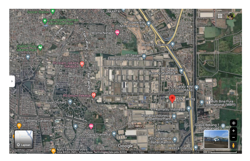
Figure 1. Satellite View of Kawasan Berikat Nusantara