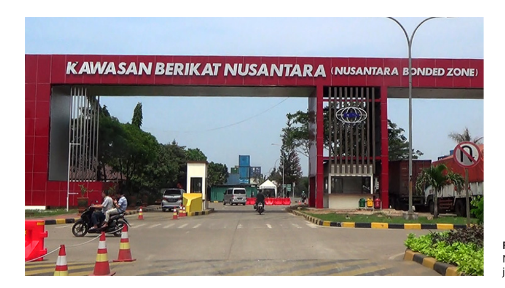
Figure 2. Kawasan Berikat Nusantara.

DKI Jakarta ranked fifth among provinces with the most garment and textile workers in 2016. The research location, the Nusantara Bonded Zone or Kawasan Berikat Nusantara (KBN) in Cilincing, North Jakarta, is an area where garment, footwear, and textile workers are concentrated since this industrial area is a complex in which 94 companies are located, most of which operate in the garment sector. In 2018, the record showed that there were 50,000-70,000 women workers producing various textiles to be exported (Perempuan Mahardhika, 2018). The information boards for company announcements at the Cakung KBN also often contain posters for hiring new workers that specifically put being a woman as one of the requirements.