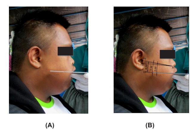
Figure 1. (A) Profile picture of the subject with a mounted Fox plane, the Fox plane appears as a straight line; (B) Photograph of the subject after tracing using Autocad 2013

height was adjusted to the position of the subject's head until the fox plane was seen as a straight line on photo. The distance between the camera and the subject's sagittal plane was one meter. The parallelism of the fox plane with the ala-tragus line was then analyzed in the photo results.9,12 Tracing the photo was done using Autocad 2013 software (Autodesk, USA).9,12 The line was drawn from the inferior border of the ala of the nose to the tragus point (superior, middle and inferior) then the angle of intersection between the fox plane with each alatragus line was measured (Figure 1). The resulted angle values were recorded for data analysis.9,12 The ala-tragus line which is considered as the most parallel to the occlusal plane is the line that forms the smallest angle to the fox plane. Data analysis of this research was carried out using t-test to test the difference of two mean values in two populations.