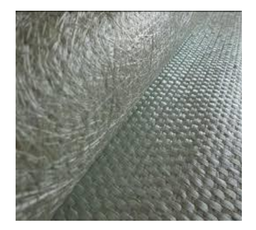
Figure 1. Bidirectional and woven fiber (Mallick, 2007).9

The objective of this study was to examine the effect of adding non-dental e-glass fiber from the preparation in the compression zone on the impact strength of acrylic resin base plate In this study we made the addition of non-dental fibers with different orientations, bidirectional (Figure 2),unidirectional (Figure 3), and woven. This study is expected to be able to provide information about the best