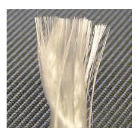
Figure 2. Unidirectional fiber (Mallick, 2007).9

orientation and position of non-dental glass fiber to be applied as a reinforcement in the manufacture of acrylic resin base plate.