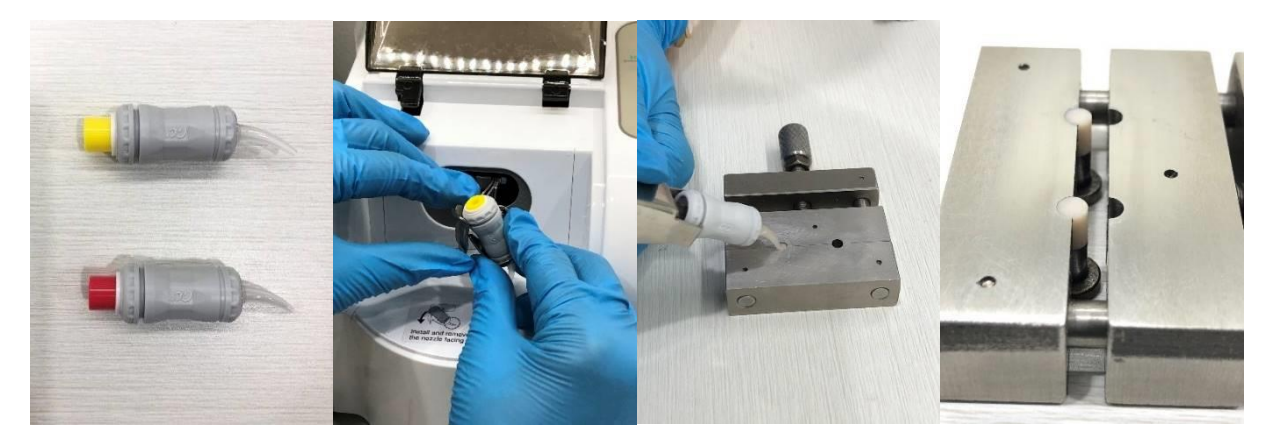
Figure 1. Preparation stages of glass ionomer cement samples

The mean compressive strength of the glass ionomer cement based on the types of the material